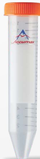
15 ML 17000 g