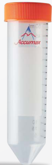
50 ML 20000 g